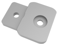
1-1645G Guide • Suit security door 21.5mm. Grey plastic. Mounted on door top.