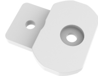
1-1647W Guide • Suit security door 25.8mm. White plastic. Mounted on door top.