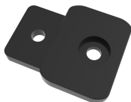
1-1646B Guide • Suit security door 23.5mm. Black plastic. Mounted on door top.